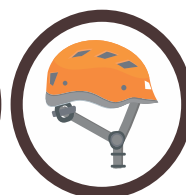
Kaciga - Helmet