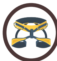
Pojas - Harness

Via ferrata SET - Obavezna oprema - Mandatory equipment